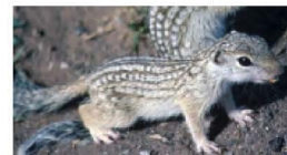
13-Lined Ground Squirrel which is often called the Striped Gopher or Minnesota Gopher